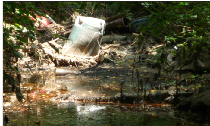
Dumping of trash — including appliances, tires, yard waste and limbs — in streams and water ways is illegal. The dumping of such objects can block stream flow, which can worsen flooding.

The FIRMs are available for viewing at the City of Jeffersonville's Building Commissioner's and City Engineer's offices, City Hall, 500 Quartermaster Court, Jeffersonville and on the City's website at http://www.cityofjeff.net/ .